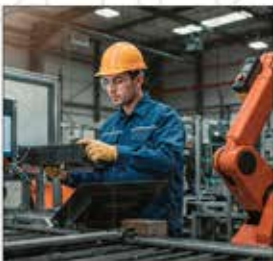
Manufacturing & Production

We cater to a wide range of industries including: