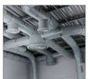
HVAC & Building Automation